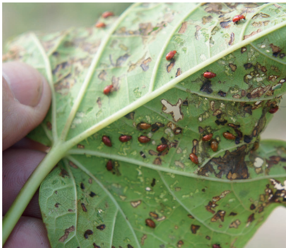
Figure 4: Close up of flea beetle infesting jatropha leaf.

Major obstacles that prevent significant progress in improving jatropha production systems are primarily related to the difficulties in increasing seed yield. Advances in plant breeding for optimizing oil quantity and quality have been made in the EU FP7 JATROPT project ( www.jatropt.eu ), where genetic marker maps should result in stable varieties, with predictable seed and biomass productivity and low phorbol ester content. Additional research should focus on the response of crop growth and production of different jatropha genotypes to variations in radiation, temperature, water and nutrients. Other research areas might then look at more efficient use of available resources, for example by optimizing production system design adapted to local environmental and socio-economic conditions. Specific research should lead to pest and disease management plans, including tolerance or resistance in plant breeding programmes. Another pending question is to identify what productivity levels are acceptable for the different agro-ecological zones , and what production systems are most efficient and socially acceptable in the local context.