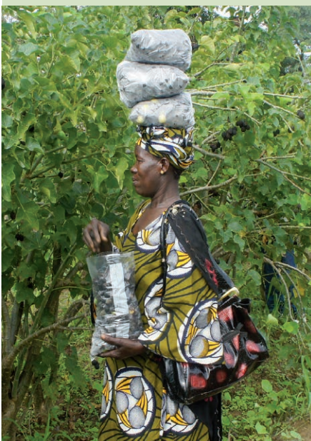
Harvesting of jatropha fruit from a living fence in Mali.

Attempts to domesticate jatropha and initiate viable oilseed production chains have led to ambitious projects with many failures. Difficulties with taking decisive steps forward are primarily related to the increase in seed productivity in beneficial and sustainable production systems. In Africa, there is tremendous potential for optimizing agronomy measures, but advances in plant breeding and crop management are required to increase oil yield, oil quality and nontoxic press-cake in stable varieties with predictable seed and biomass productivity. Such qualities reduce risk and increase the chances of jatropha playing a role in sustainable livelihoods of African farmers (Muys et al., 2013).