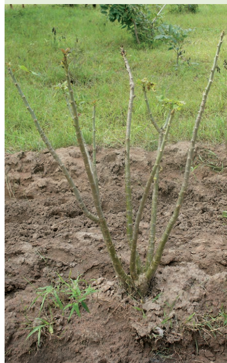
Figure 5: Mali: A three-year-old jatropha plant defoliated by a flea beetle of the Apthona genus, one of the most serious insect pests; different species occur in various parts of Africa.

Yield gap: difference between potential yield, based on radiation, temperature, (effective) precipitation, and observed yields, often limited by soil fertility and reduced by pests and diseases.