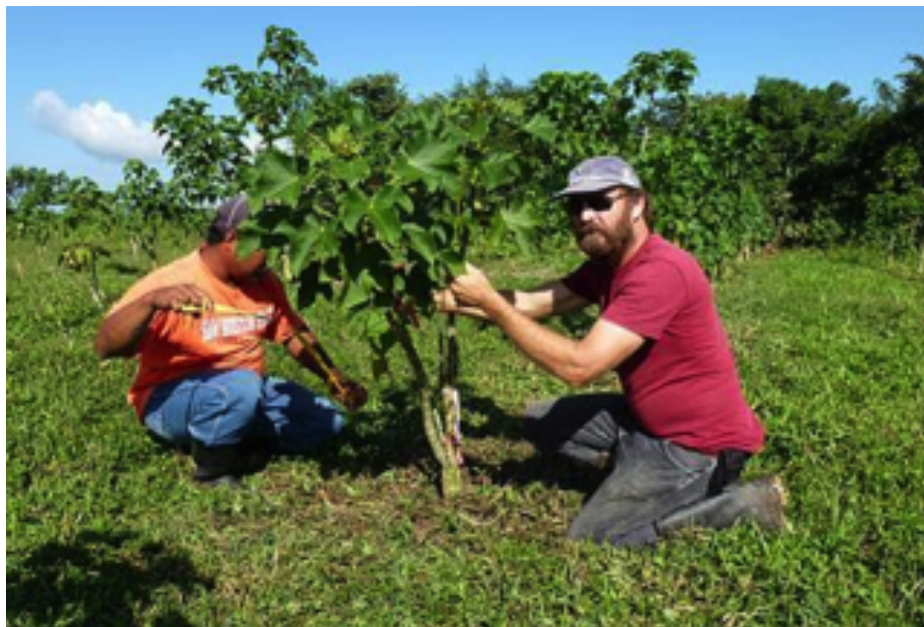
Figure 2: Fieldwork in Belize: Taking measurements to determine biomass growth (stems and leaves) via allometric relations.

Jatropha growth rates differ across locations, but always lead to green bushy trees (Figure 2). Jatropha is like other crops: it grows better at higher radiation levels, appropriate temperatures and with a good supply of water and nutrients. It has been found that seed production is not linearly related to an increase in aboveground biomass, and varies greatly across locations for reasons that are not yet fully understood. A yield gap of 75% or more between potential and actual productivity can be expected, as with many other crops in Africa (Bindraban et al., 2012). In hedgerow production systems, seed yield per plant is reduced due to direct competition for resources with neighbouring plants. In contrast, in intercropping, yield is often higher than in monocultures because it benefits from the management of the associated crop. In the Bioenergy in Africa , Jatrophability and Probi- ofuel projects, genetic resources, nutrient availability (fertilizer application), pests and diseases were identified as major factors in reduced productivity in monoculture, intercropping and hedgerow production systems.