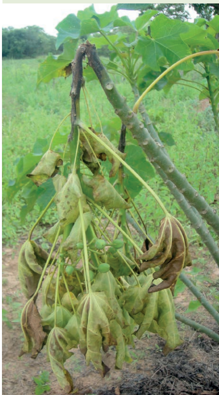
Figure 3: Burkina Faso: A jatropha plant with stem canker, one of the most serious pathogenic diseases affecting jatropha in West Africa.

Integration of biofuels and biogas: the Probi- ofuel (Prospects for Sustainable Biofuel Production in Developing Countries: A Case Study of Kenya, East Africa) project's aim was to evaluate the potential to integrate biofuels and biogas into smallholder farms. Results showed that performance of jatropha was positively linked to humid conditions, well distributed annual rainfall of 500–750 mm, moderately sandy to loam soils, neutral pH and a high level of management.