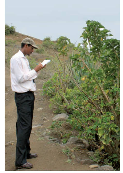
Figure 2: In Bati (Ethiopia) jatropha is used as fences around plots and as a soil and water conservation structure. The build-up of biomass and collection of seeds to secure local energy needs also allows for GHG savings.

Optimal crop management practices for jatropha currently remain undetermined. In East Africa, this was one of the key factors leading to poor yields and inefficient use of inputs, especially in the case of block plantations, whether commercial or smallholder monocropping and intercropping systems. Fencing systems and hedges, however, are often not managed and therefore generate minimal GHG emissions during cultivation (Figure 2).