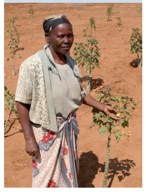
Figure 1: Kenyan farmer in Kibwezi showing her one year old jatropha plantation. Growth rate is low and carbon sequestration potential is limited.