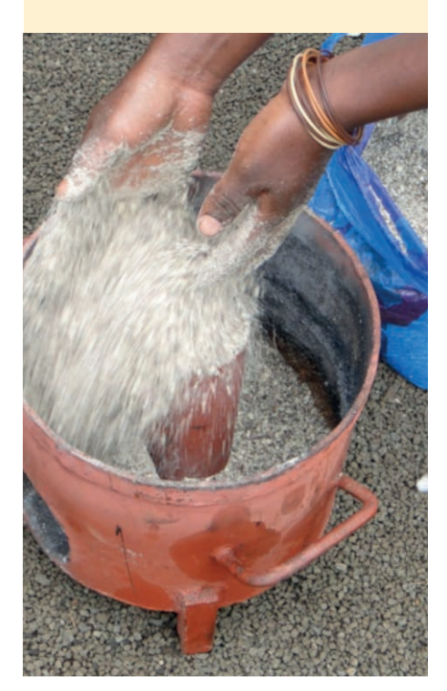
Figure 2: Jatropha press cake being poured into an experimental cooking stove in Arusha, Tanzania. The central cylinder is removed after filling the stove, and the fire is lit within the hollow tube. Smoke is given off during combustion because the press cake contains oil residues, especially following pressing with low efficiency ram presses.

However, there were also challenges using SJO: machines clog more easily than with diesel, and SJO proved to be more expensive than conventional diesel to power stationary or vehicle engines, at the current price of USD 1.25 per litre of fossil diesel (ERC 2013).