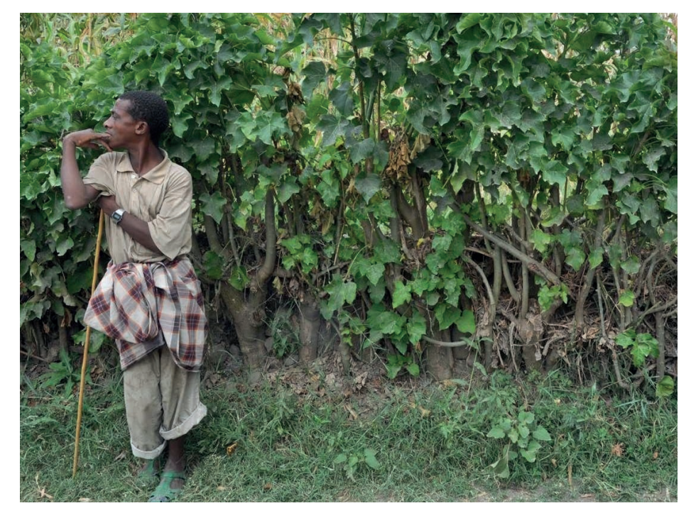
Figure 4: In Bati, Ethiopia, jatropha is used as a fence around plots and as a soil and water conservation structure to rehabilitate erosion gullies.

place firewood and is therefore not a realistic alternative for cooking. This could change if press cake cooking stoves are developed that have a much higher level of efficiency than traditional firewood cooking places. Smoke generated from burning press cake is another challenge that needs to be addressed and clean burning equipment should be developed.