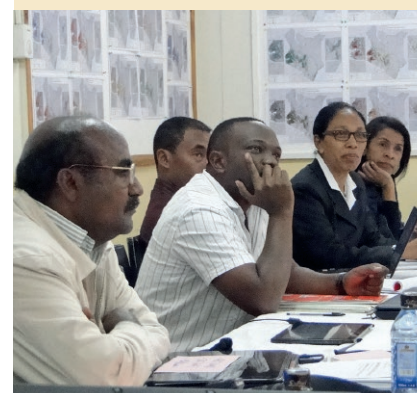
ESAPP partners attending a Capitalization Workshop in Nanyuki, Kenya, discuss ways of exchanging spatial and statistical data within the ESAPP network and beyond.