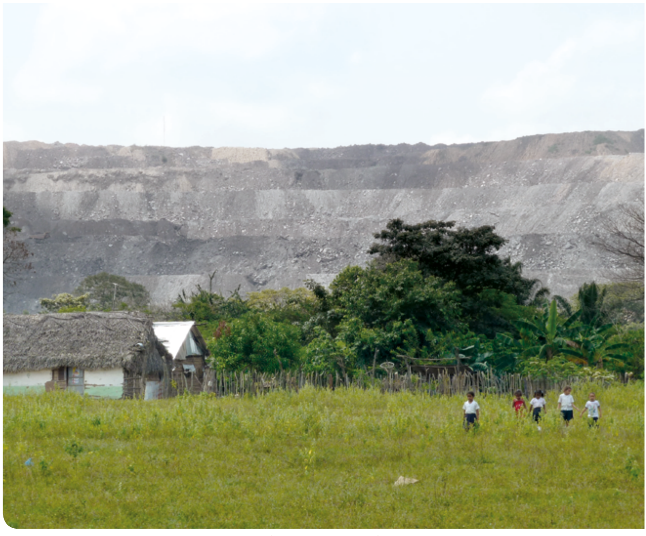
Storage of coal waste on the lands of the El Hatillo community in Colombia has had devastating impacts. Although resettlement talks began six years ago, the matter is unresolved.

benefit from the introduction of such technologies, the lasting impacts of such shifts are unclear due to the lack of comprehensive sustainability assessments. Moreover, modern technologies have been linked to deskilling at the farm level, and resulting dependency on external inputs like seeds, fertilizers, and pesticides likewise increases exposure to market volatility. 6-9