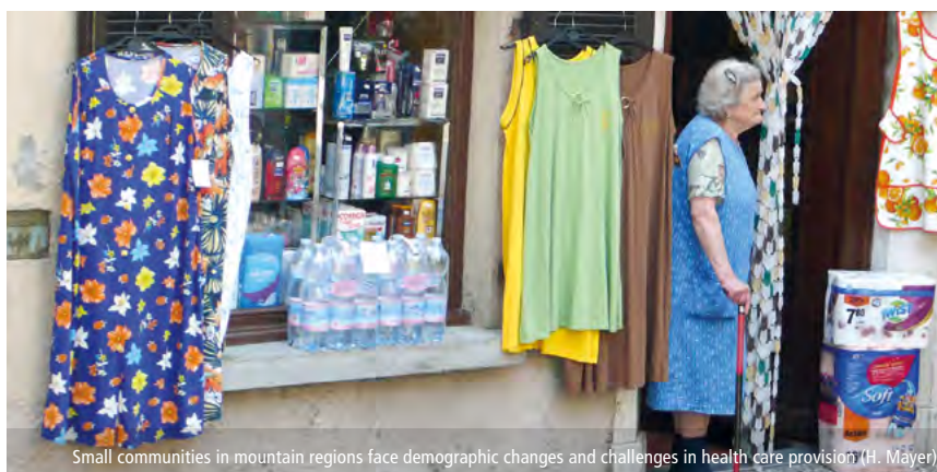
Small communities in mountain regions face demographic changes and challenges in health care provision

Oberland. The emergency centre helps to coordinate the periods in which the GPs are legally required to provide emergency assistance, helping to decrease their workload and thus making this type of work more attractive.