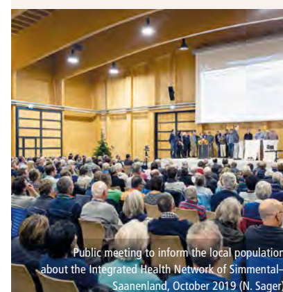
Public meeting to inform the local population about the Integrated Health Network of Simmental-Saenenland, October 2019 (N. Sager)

“Trust has been built within the region. The pressure on all actors is high. The project can only succeed if everyone stands together.”